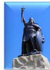
King Alfred the Great